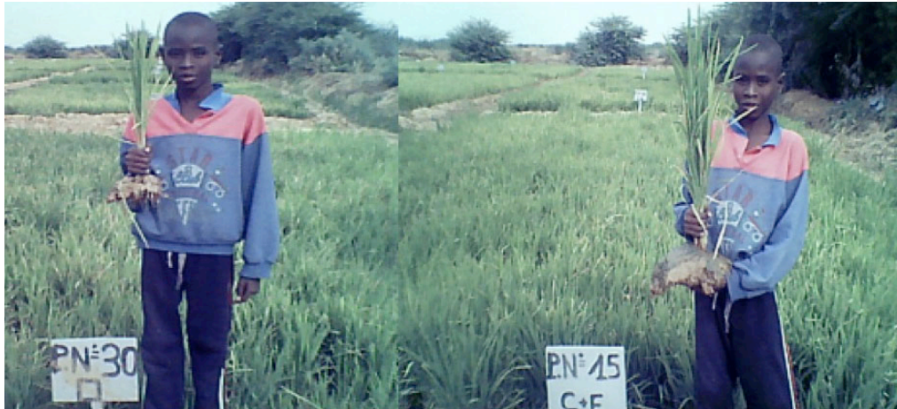
Rice without biochar in Northern Senegal

This is no easy task, but it is worth attempting. As summarised by scientist James Lovelock, author of 'The Gaia Theory', 'There is an outside chance that one procedure could really turn back the clock on Global warming and that is burying carbon. All you have to do is get every farmer everywhere to make a profit by turning all his agricultural waste into char and burying it.'