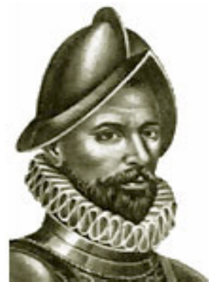
Francisco de Orellana

On 5 August 1495 Christopher Columbus received a rather peculiar letter from Royal Cosmographer Jaume Ferrer de Blanes. Ferrer was writing to inform Columbus of his discoveries in the New World, and in particular the apparent correlation between 'great and valuable things' and 'hot regions inhabited by darker skinned peoples.' He continued, 'and therefore, in my judgement, until Your Lordship meets such peoples, You shall fail to find an abundance of such things.' Seduced by the prospect of treasure, on his next voyage across the Atlantic Columbus turned sharply towards the equator, discovering South America. The consequences of Ferrer's flawed logic would transform the face of the world, and the entire way of life for indigenous Amerindians.